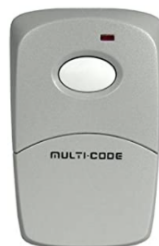
Linear 3089 Multicode 3089 Compatible Visor Remote Opener ★★★★☆ ~ 6,381 $15 48 $46.23

If you do not have a remote, they can be purchased from Overhead Door for $40 each. Amazon, search for “MULTI-CODE 3089” or “Linear 3089”