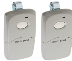
2 Pack 3089 Linear Multi-Code Remote Transmitter Gate Garage Opener Brand New ★★★★☆ ~ 3,347