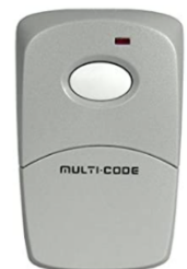
Multi-Code 3089 by Linear ★★★★☆ ~ 32 $17 95 prime FREE One-Day